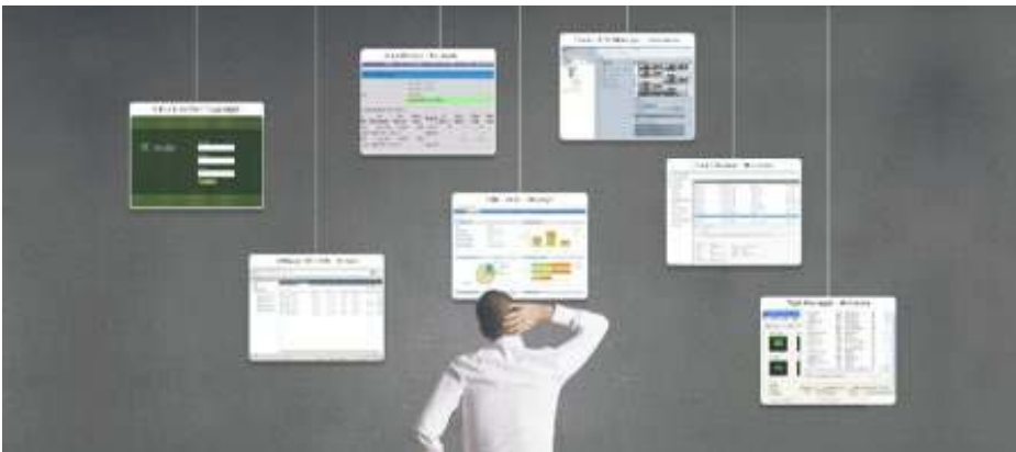
Using multiple tools makes problem diagnosis challenging

Compared to Citrix XenApp 6.5, Citrix XenApp and XenDesktop 7.x provide more capabilities to track user experience. Real user logon times, breakdown of logon time