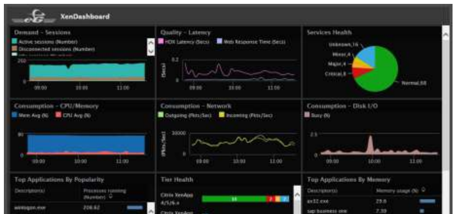
Custom dashboards provide Citrix farm-wide views